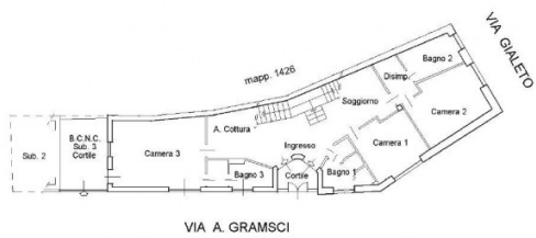
VIA A. GRAMSCI