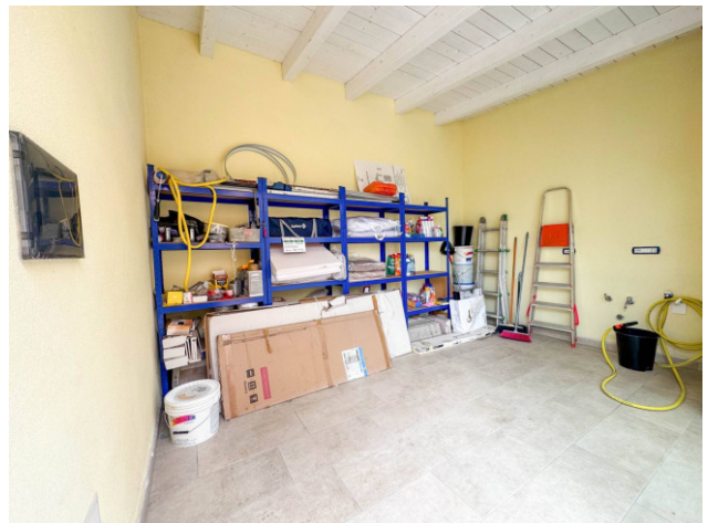
PIANO TERRA H. 2.70